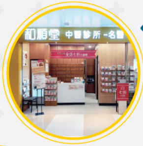
Wellsoon Chinese Medicine Clinic 和順堂中醫診所 Shop 2025