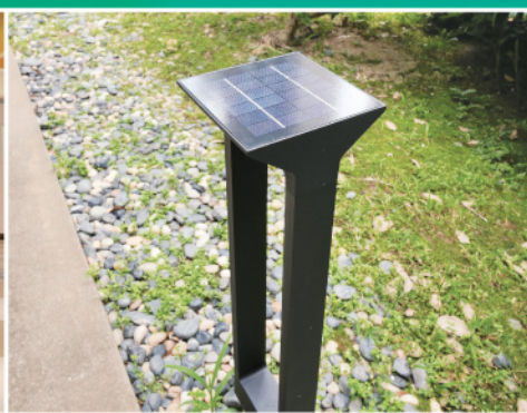
Solar lights at Dah Sing Financial Centre and Strand 50 to power up the outdoor podium at night.