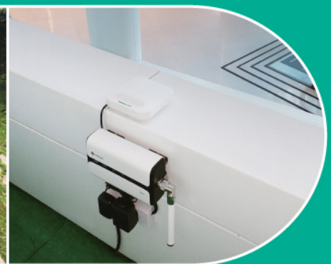
Indoor air quality sensors in our shopping malls to monitor air quality such as levels of carbon dioxide and PM2.5.