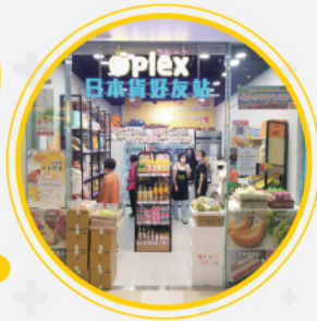
Apex 日本貨好友站 Shop 2080