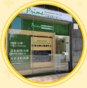
Prime Rehabilitation Services 迅康復康治療中心 Shop G4B