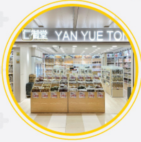
Yan Yue Tong 仁御堂 Shop 2090-90A