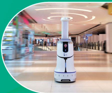
UV-C disinfection robot to carry out sanitization at Sheung Shui Centre Shopping Arcade.

We have adopted property technology (proptech) to implement our sustainability initiatives by various approaches :