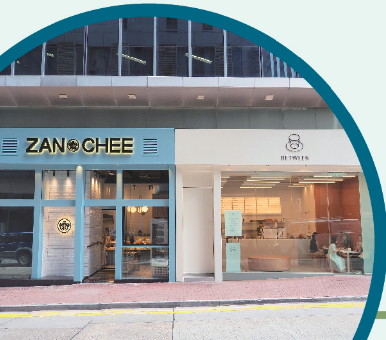
◀ The Modern Dining Scenes in Wan Chai: ZAN@CHEE and BETWEEN™

BETWEEN™ , rooted in the community since 2020, embraces its surroundings and establishes its own culture of lifestyle, art, and design. It serves a wide range of signature blends, coffee cocktails and wellness beverages.