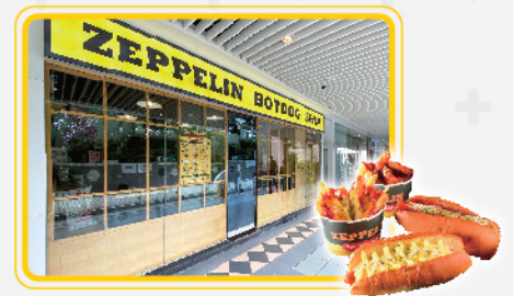
Zeppelin Hot Dog Shop 2230