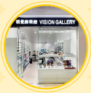
Vision Gallery Shop 246B