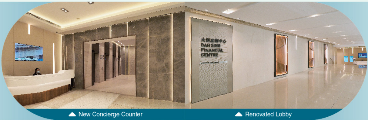
▲ New Concierge Counter