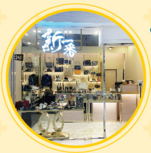
SHOESON Shop 265