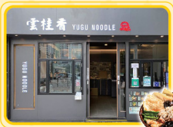
Yugu Noodle Shop G105-106