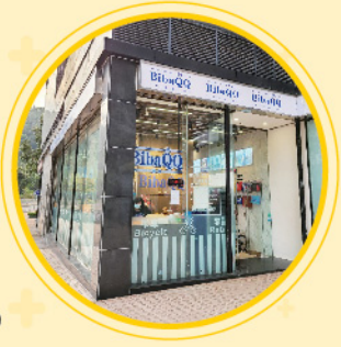
Biba QQ Shop G4A