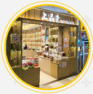
Top Health Shop 2082