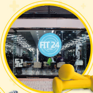
Fit 24 Fitness Shop G5&9