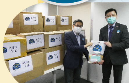
▲ THE SALVATION ARMY