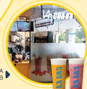
CHA KA Shop 2077B