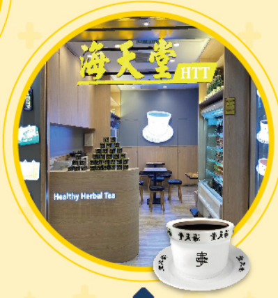
Hoi Tin Tong Shop 2083