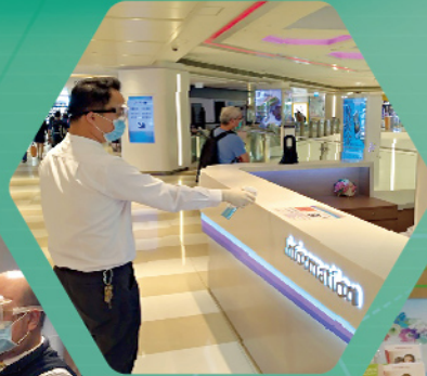
Sheung Shui Centre Shopping Arcade