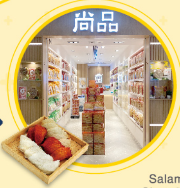
Premier Food Shop 2104