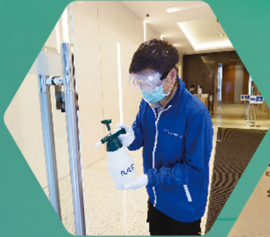
Core Office Properties