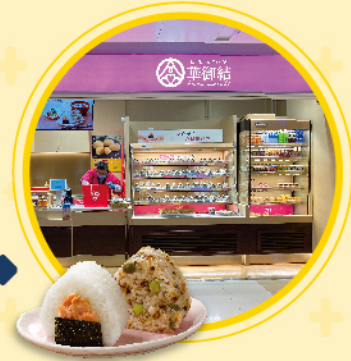
hana-musubi Shop 2016