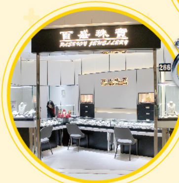
Passion Jewellery Shop 266