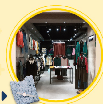
Salamola Shop 2215