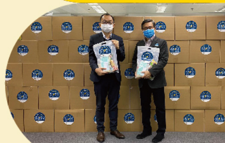
▲ ST. JAMES' SETTLEMENT