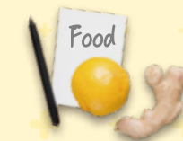
U select Shop 272-274