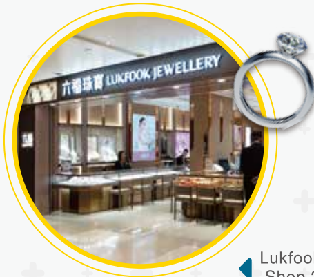
Lukfook Jewellery Shop 2039-2040