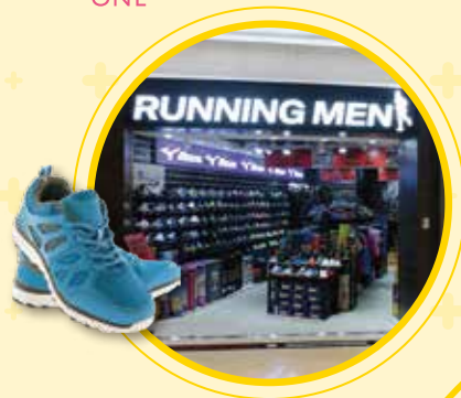
Running Men G32