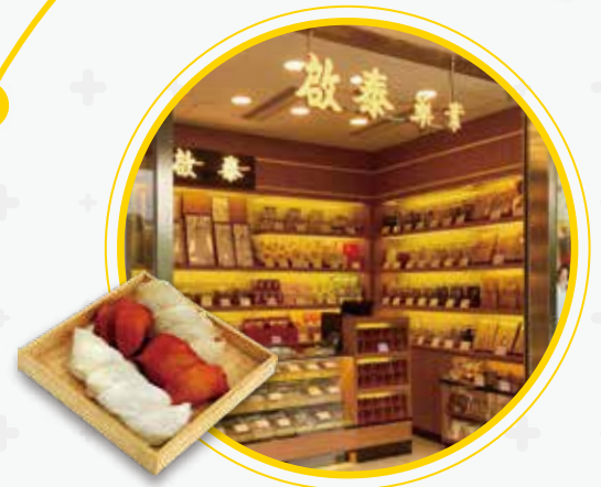
Kai Tai Chinese Medicine Shop 2060