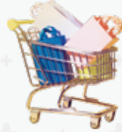
ORiental TRaffic Shop 2017