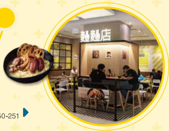
MiMiDi Shop 241 & 250-251